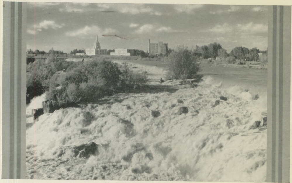
The Falls, Idaho Falls, Idaho